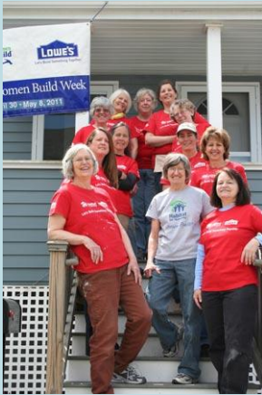
The SCHH Women's Crew!

The Women's Crew works tirelessly every Thursday, doing whatever needs to be done. For the past few weeks, they've been making our Pierce Street home ready for a new Habitat homeowner. Thanks for all you do, Women's Crew!